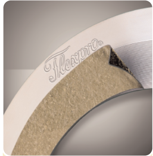
CRITICAL SERVICE SERIES Thermiculite® 845, high temperature facing for Flexpro (Kammprofile) gaskets.