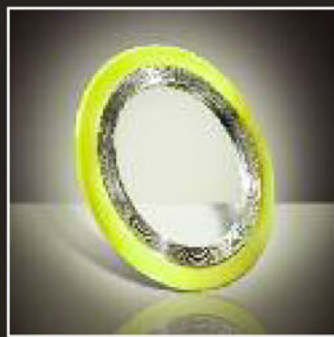
THERMICULITE® 835 Spiral Wound Filler

High temperature sheet reinforced with a 0.004" 316L stainless steel tanged core. Available in thicknesses of 1/32", 1/16", and 1/8" in meter by meter (standard) and 60" x 60" sheet. Cut gaskets also available in all shapes and sizes.