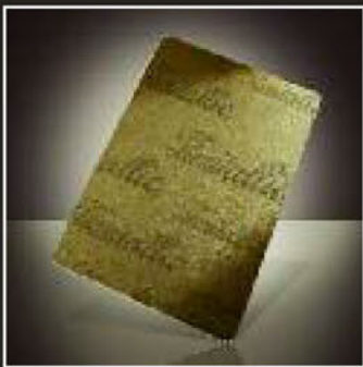
THERMICULITE® 815 Tanged Sheet

High temperature sheet reinforced with a 0.004" 316L stainless steel tanged core. Available in thicknesses of 1/32", 1/16", and 1/8" in meter by meter (standard) and 60" x 60" sheet. Cut gaskets also available in all shapes and sizes.