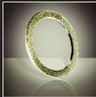
THERMICULITE® 845 Flexpro™ (kammprofile) Facing

High temperature filler material for spiral wound gaskets. Wide range of metals available.