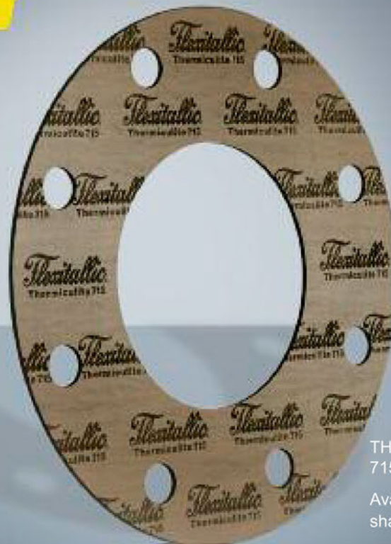
THERMICULITE® 715 Cut Gasket