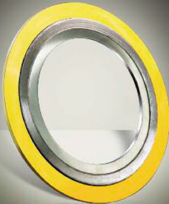
THERMICULITE® 835 Spiral Wound Filler